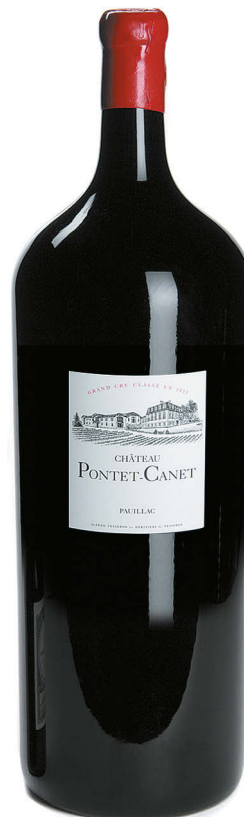
Nabuchodonosor 15 litres 20 bottles