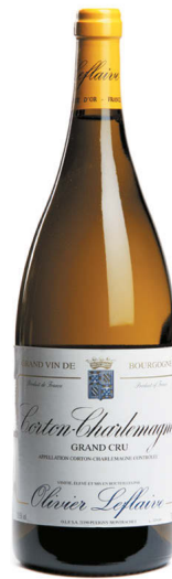
Jéroboam Hors-Bordeaux 3 litres