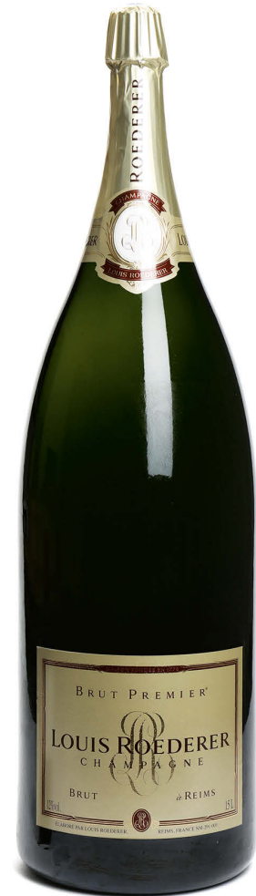
Nabuchodonosor 15 litres 20 bottles