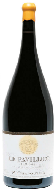
Mathusalem Hors-Bordeaux 6 litres 8 bottles