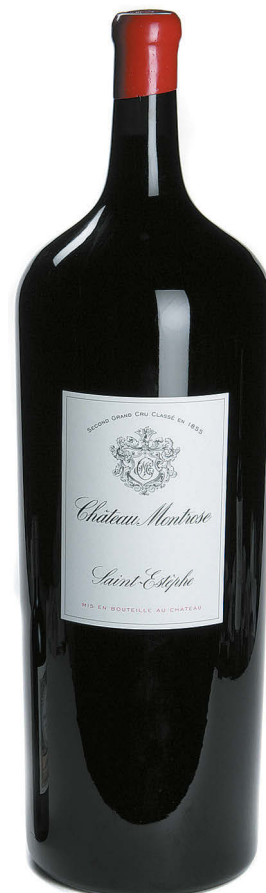
Melchior 18 litres 24 bottles