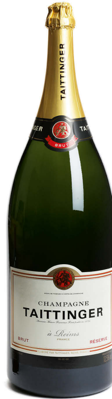
Balthazar 12 litres 16 bottles