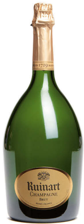
Jéroboam 3 litres 4 bottles

These large formats are available in very limited quantities.