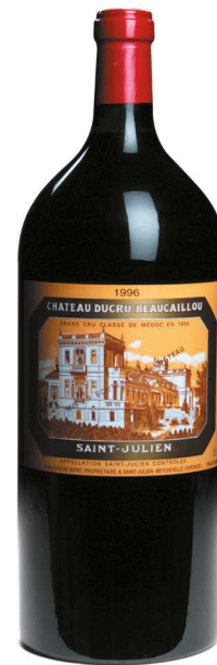
Impériale Bordeaux 6 litres 8 bottles