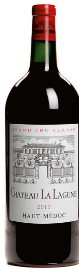
Double-magnum Bordeaux 3 litres