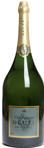
Mathusalem 6 litres 8 bottles