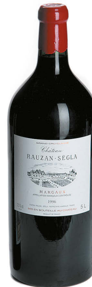
Jéroboam Bordeaux 5 litres