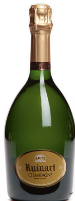
Magnum 1,5 litre