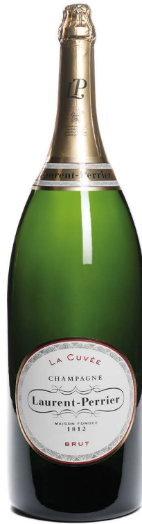
Salmanazar 9 litres 12 bottles