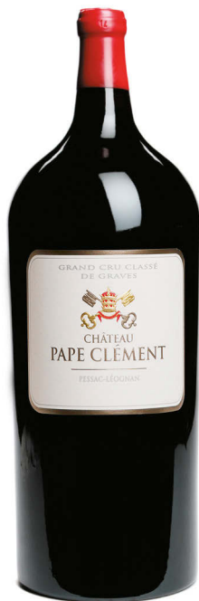
Salmanazar 9 litres 12 bottles