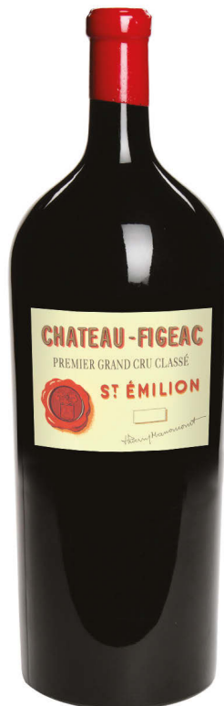
Balthazar 12 litres 16 bottles